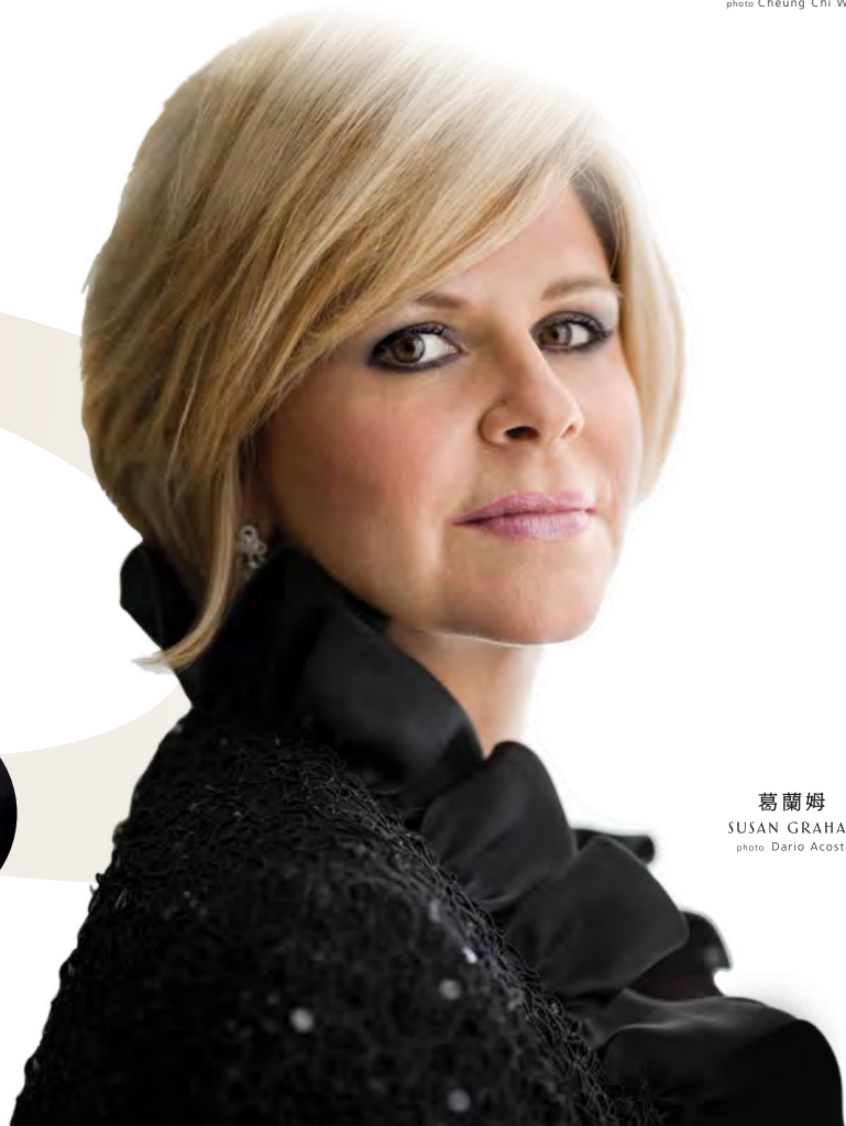
葛蘭姆 SUSAN GRAHAM