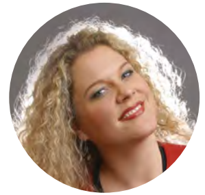
迪楊 MICHELLE DEYOUNG

Edo de Waart conductor Michelle DeYoung mezzo-soprano Stuart Skelton tenor