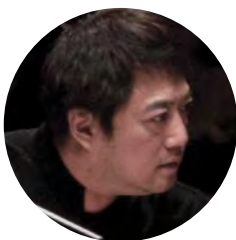
呂嘉 LÜ JIA

Lü Jia conductor Frank Peter Zimmermann violin