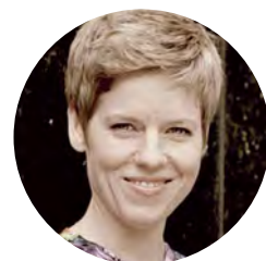
伊莎貝·浮士德 ISABELLE FAUST

巴托的第一小提琴協奏曲是一封寫給小提琴家姬雅的情書〔可是女方沒有給予回應〕，這封情書被雙方藏得很密，直至巴托死後才被人發現。和這個沒結果的愛情故事一樣，這首情意洋溢的樂曲亦無疾而終。《茨維考》交響曲是舒曼第一首嘗試創作的交響作品，而幻想曲則屬較後期的成熟作品，當中的一段小提琴獨奏令人嘆為觀止，顯盡舒曼處於創意巔峯期的爆發力，是一首為小提琴家伊莎貝·浮士德度身訂造的曠世傑作。《神奇的滿大人》奇異怪誕，啞劇演員令人生畏，縱使首演至今已近百年，依然震撼。神奇的滿大人刀槍不入，三次被行刺皆絲毫不損，惟有讓他感到愛，才能把他殺死。