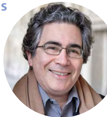
利茲 CARLO RIZZI

Carlo Rizzi conductor Isabelle Faust violin